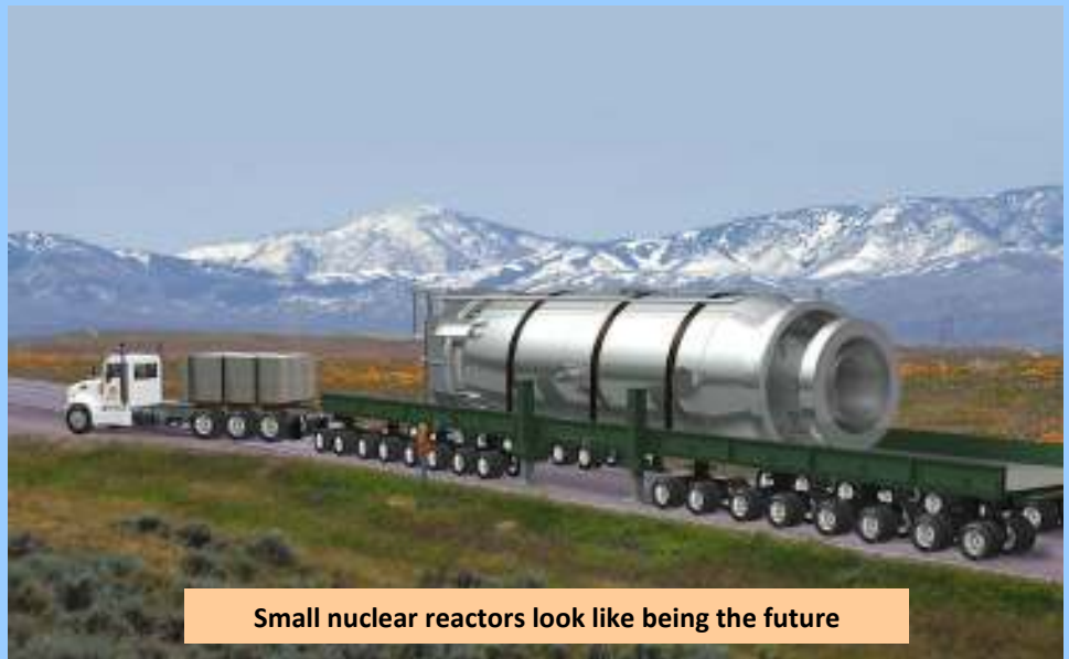
Small nuclear reactors look like being the future

Nuclear won’t sort out climate change by itself but climate won’t be sorted without nuclear. And it will do so silently.