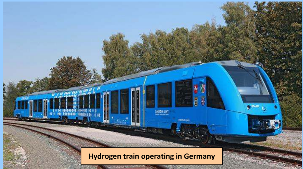
Hydrogen train operating in Germany

The new trains are both quieter and cleaner. For example, the combined diesel-electric system that also incorporates batteries which Rolls Royce has been developing has been found to be 25% more fuel-efficient than current trains and much quieter